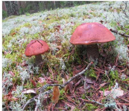
Mushroom Road: Linking Nordic and Baltic experience (Latvia)