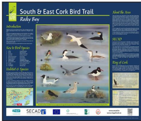
Eco-education centre development (SECAD, IE)