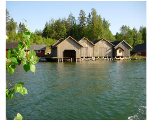
Life and Fire (focus on the condition of the Baltic Sea)